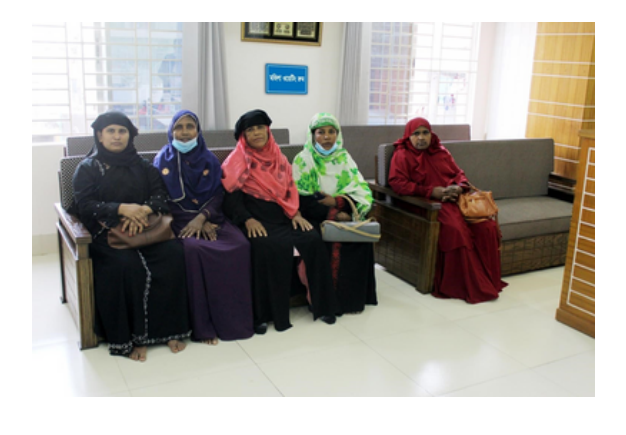
Ladies Waiting Room