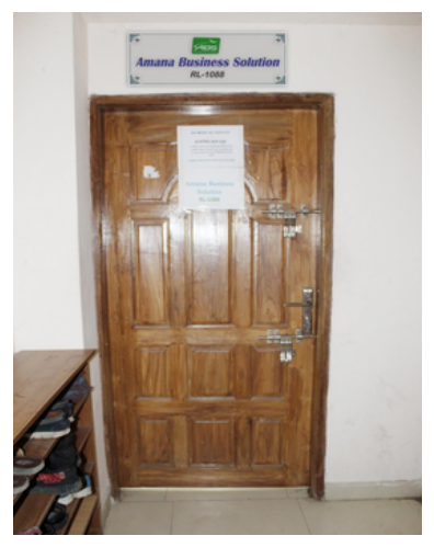
Main Office Door